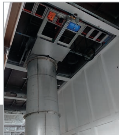
Fig. 3: Fire shut-off guillotine