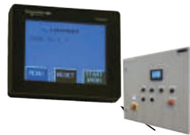
Fig. 3: Main chute control system