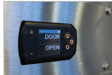
Fig. 2: Display next to each door