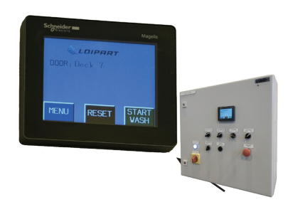
Fig. 3: Main chute control system