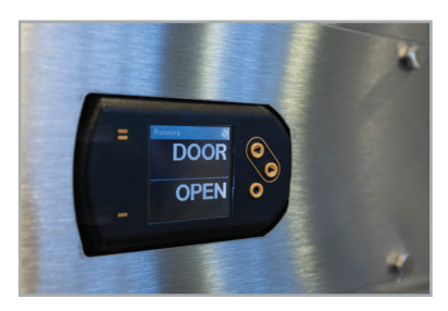
Fig. 2: Display next to each door