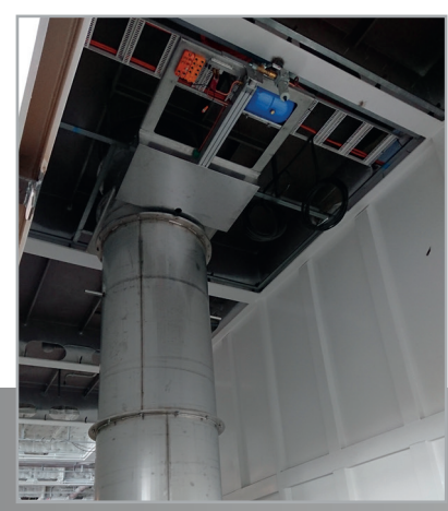
Fig. 3: Fire shut-off guillotine

We have for several years been working with environmental development within the maritime and offshore sector with a focus on ship-generated garbage.