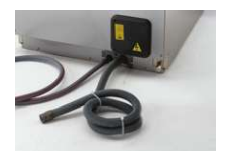
Highly durable water hose

The boiler, being made of A304L, is resistant to chlorinated water and is welded in an inert atmosphere to avoid contamination during the production process.