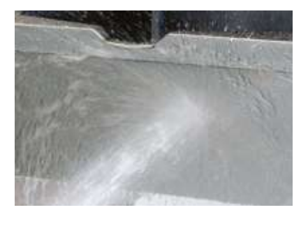
IPX4 water protection

Wash and rinse arms are easily removable for cleaning.