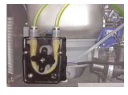
Failproof chemical tube connection

The water supply hose has metal connections to withstand high water pressure and accidental shocks during installation.