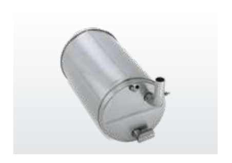
Boiler resistant to chlorinated water

All models are certified IPX4 for water protection.